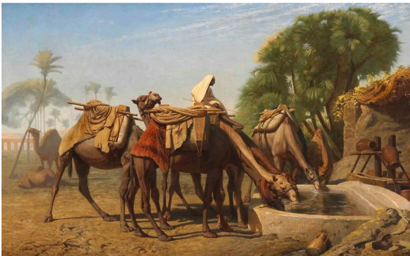
Fig. 1, Jean-Léon Gérôme, Camels at the trough , 1857, oil on canvas, 75 x 120 cm, National Gallery of Canada

This trip would prove to be highly significant for Gérôme: not only did it foster a deep-seated love for Egypt but it also turned him, almost overnight, into the leading Orientalist of his day. The dozens of sketches and studies, and the impressive collections of photographs and local goods amassed by the artist, allowed Gérôme to create in his Paris studio a group of meticulously detailed and highly polished Orientalist paintings exhibited at the Salon of 1857 to great acclaim (fig. 1). As Gérôme himself wrote of this preparatory material, 'I did not know beforehand what I was going to do with these studies...brought back from travels. It is only later that ideas come: there is an unconscious labour in the brain and, suddenly, they are born!'. 1