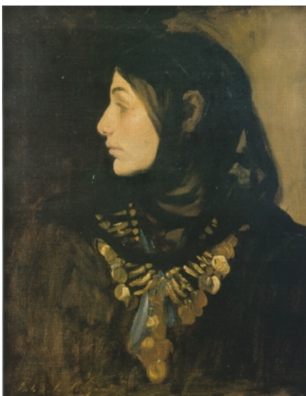
Fig. 4, John Singer Sargent, Fellah woman , oil on canvas, 56 x 46 cm, Private Collection