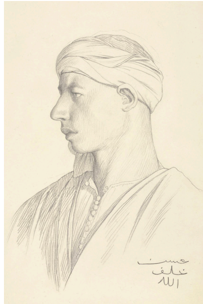
Fig. 3, Jean-Léon Gérôme, Portrait of a man , 1856, graphite on paper, 26.7 x 16.2 cm, J. Paul Getty Museum